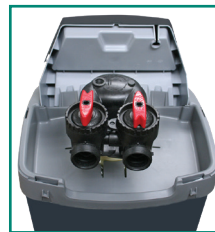
Back of System